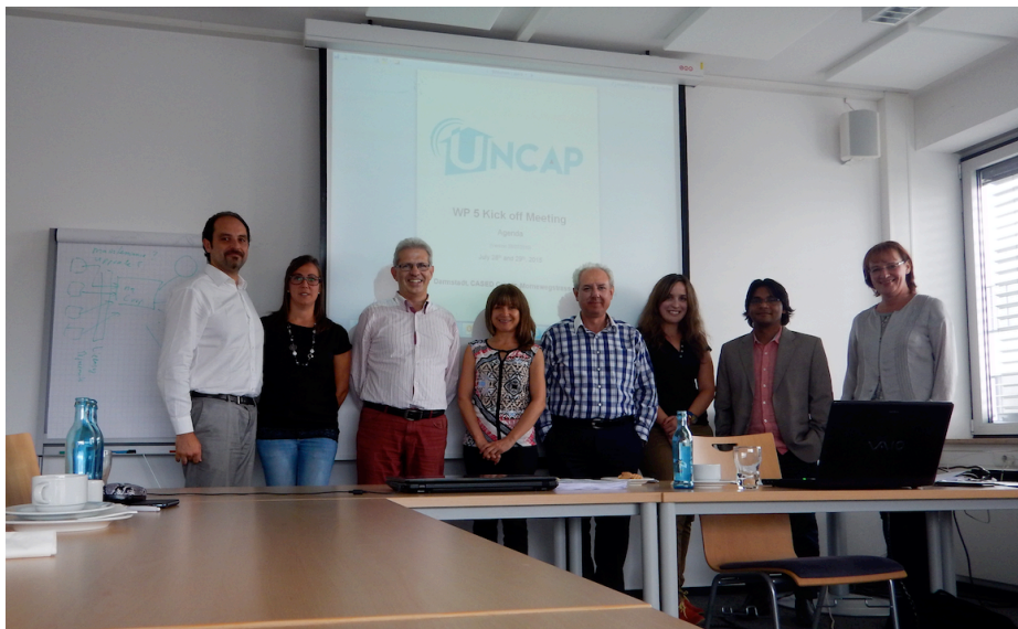
The international team to accomplish the UNCAP access-to-market

The German business acceleration company INI-Novation GmbH welcomed its international guests as leader of the work package and highlighted the goal to develop relevant business and service delivery models addressing the private and the public eCare sector. The UNCAP products and services will be underlined by business concepts to achieve market attention, market and investor's readiness, market entries as well as market expansion and scalability.